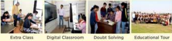
Extra Class Digital Classroom Doubt Solving Educational Tour